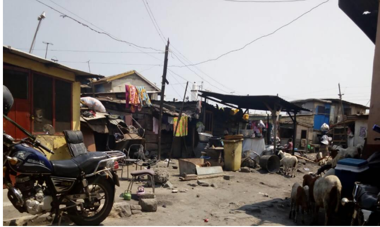
Figure 6: Portion showing the unplanned nature of settlement

Another problem that exist in slum areas is the fact that most settlement are unplanned and as such makes navigating very difficult in the community in times of emergency such as fire out-breaks, natural disasters and other accidents, Figure 6 delineates the unplanned nature of settlement in the study area.