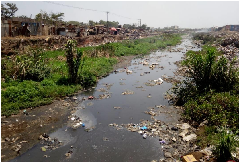
Figure 5: Portion showing poor drainage in the community

Figure 4 clearly shows another characteristic of a slum area, a place that has poor sanitation due to lack of proper garbage and sewage disposal leaving sewage in the community. This provides a fertile ground for breeding mosquitoes and other insects which can lead to the spread of diseases exposing both young and old to health risks that leads to death.