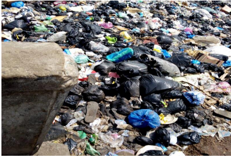
Figure 8: Dumping site of waste materials in the community

These pictorial Figures (2 to 8) clearly shows that poor sanitation due to lack of proper garbage and sewage disposal. Housing system made of wooden structures, poor road network, poor drainage systems and many others are the most dominant features in this area that contribute to this menace. Thus, these features align with Niebergall (2008) that explained slum as an “informal settlement that encompasses physical characteristics in terms of high spatial heterogeneity, complex shape, substandard housing, high building density, irregular pattern of road network in poor condition, poor connectivity with infrastructure, no or little vegetation that is prone to hazardous locations”.