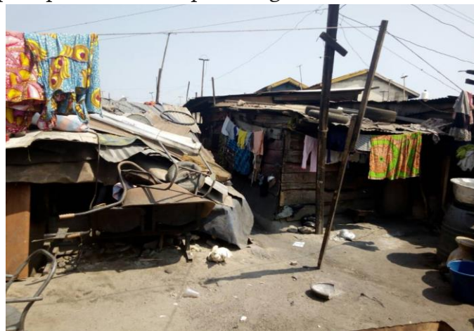
Figure 3: Portion of Sodom

The following figures provide a pictorial representation of the slum area at Sodom and Gomorrah mainly denoted by squatter settlement, densely populated temporary residential houses, built lawfully and unlawfully without water supply, sanitation facilities or health care facilities, high poverty level that reflects the miseries of deprived people who have to grapple with poverty to survive, poor housing conditions in terms of improved water, access to adequate sanitation, overcrowding, faulty arrangements of streets, lack of ventilation, light or sanitation facilities, and inadequacy of open space that end up causing diseases outbreak in the area.