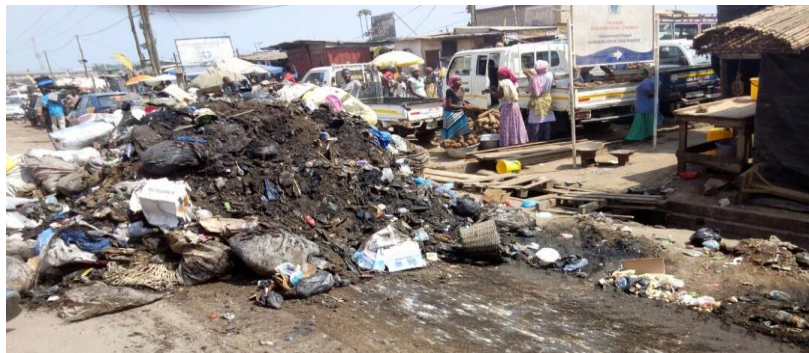
Figure 7: Portions showing lack of reliable sanitation service in the community

Another problem that exist in slum areas is the fact that most settlement are unplanned and as such makes navigating very difficult in the community in times of emergency such as fire out-breaks, natural disasters and other accidents, Figure 6 delineates the unplanned nature of settlement in the study area.