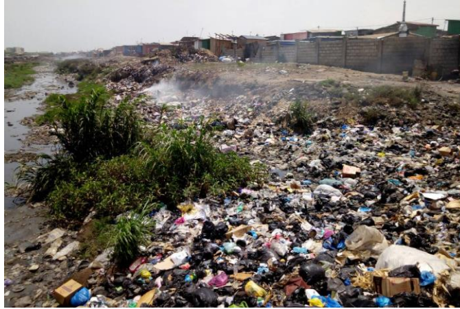
Figure 4: Portions showing poor sanitation due to lack of proper garbage and sewage disposal

Figure 3 shows how congested a respondent's settlement is at the study area, which is basically a wooden structure with an old roofing sheet.