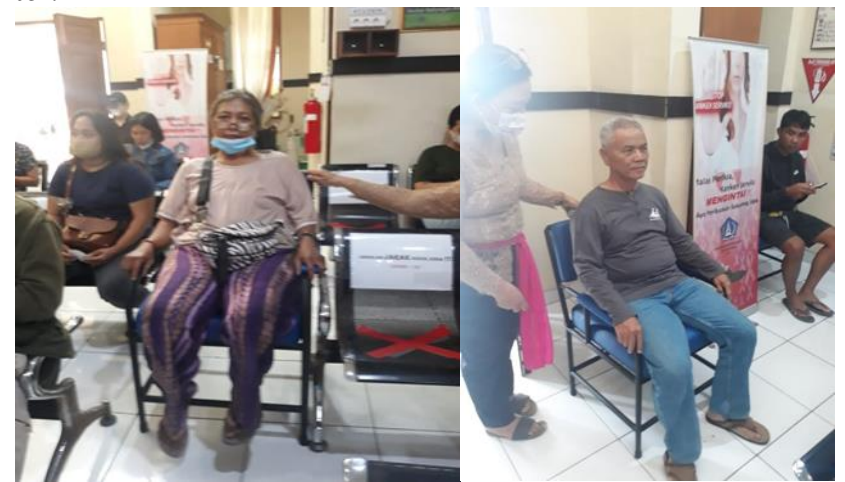
Figure 3 Priority Seat Intervention at North Kuta Health Center

Priority seat intervention on treatment (Post) for the elderly at the North Kuta Health Center.