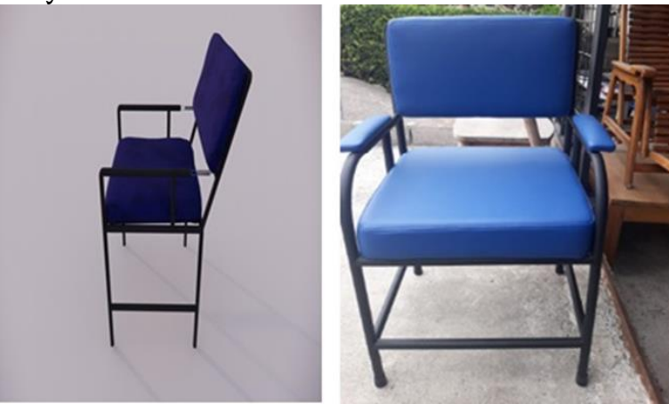
Figure 2. Priority Seat Prototype with Right and Left Side Springs

After determining the design of the final sketch, proceed with a workshop / workshop to make a real product or prototype.