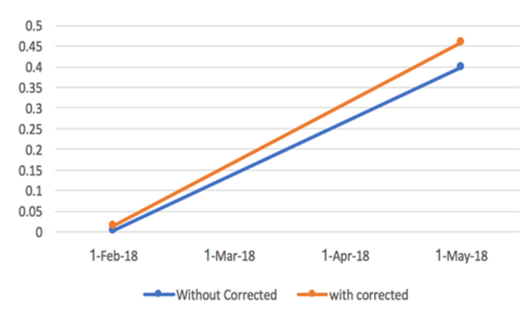
Figure 3. The result of evaluation of distance VA case 4 using ball test