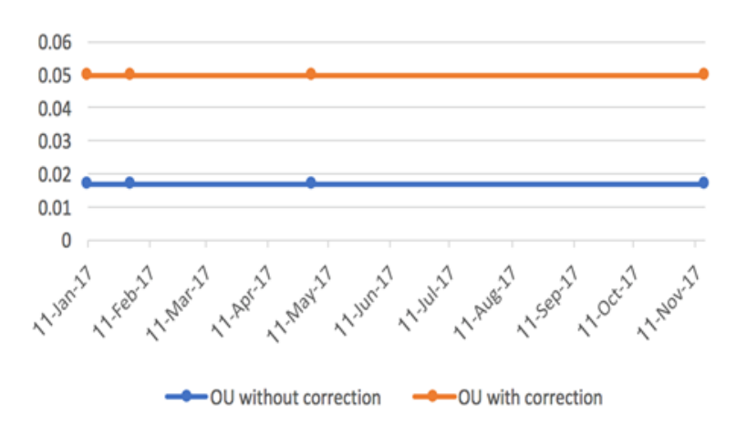
Figure 4. The result of distance VA case 5 using Lea Grating

The success of amblyopia treatment after congenital cataract surgery depends on early detection, timing of cataract surgery and the VA rehabilitation management after cataract surgery. Some ophthalmologists prefer aphakia and do secondary implant because of the patient's condition such as microcornea. During aphakia, the rehabilitation is performed using aphakic glasses or contact lens. If there are other ocular condition, for instance microcornea or supporting capsular bag which are do not accomodate for intraocular lens implantation, the aphakia will be remined as they are but the risk of amblyopia will be greater and the rehabilitation will be more challenging. Visual rehabilitation is to minimize the amblyopia and to optimize the visual function. It is suggested that the rehabilitation must be done as soon as possible after the surgery.